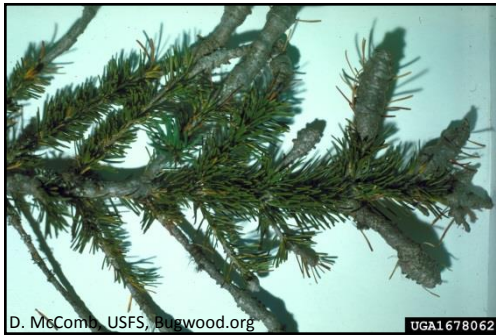
D. McComb, USFS, Bugwood.org UGA1678062

The balsam woolly adelgid (BWA for short) is wreaking havoc on balsam fir and Fraser fir forests in eastern North America. It has also made its way to the Pacific Northwest. Native to Europe, it arrived on nursery trees shipped to southeastern Canada in the late 1800s. BWA are most abundant in the fall, but the damage they cause can be found year-round.