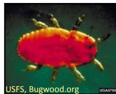
USFS, Bugwood.org UGA07997

The BWA attacks the trunks of fir trees too. Densities often reach 100-200 per square inch. The foliage turns yellow, then deep red or brown. Balsam fir trees often die within a few years.